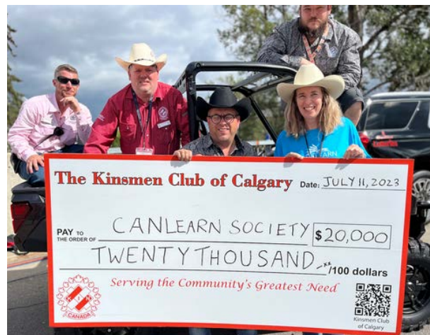
The Kinsmen Club of Calgary presented CanLearn with a $20,000 cheque - thank you for your continued support!