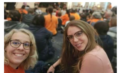
CanLearn staff attended activities around Calgary for National Day of Truth and Reconciliation.