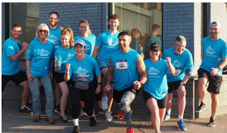
Congratulations to the CanLearn team at the Servus Calgary Marathon - They raised close to $4000!