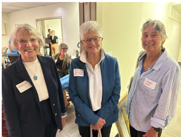
Thank you to Canadian Federation of University Women for attending our Open House and presenting CanLearn with donations for literacy